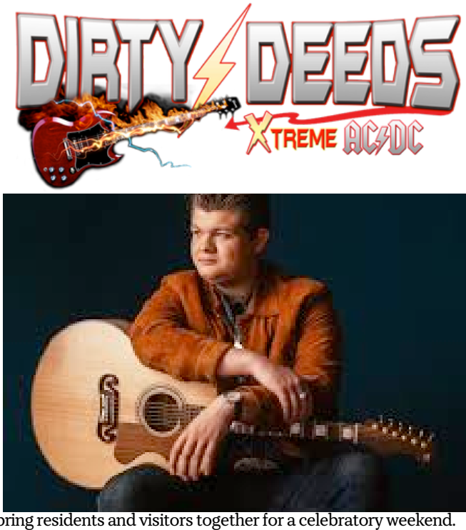
bring residents and visitors together for a celebratory weekend.

Loogootee Summerfest has become a staple in the community, offering a variety of entertainment, food vendors, and activities for attendees of all ages. This year’s event aims to